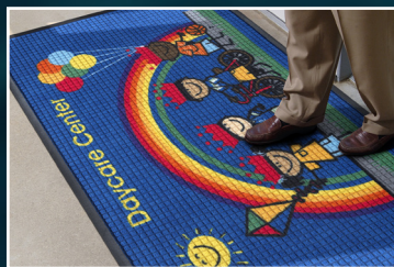
WaterHog Impressions HD®