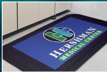
Hog Heaven® Impressions

M+A offers several different logo mat options to display your company's logo and leave a lasting impression on your visitors. Logo mats are recommended for use at entryways, in lobbies, at front desks, or anywhere you want to display your company logo, slogan, artwork, or message to customers/visitors or employees. Photographic quality can be achieved and some styles are available in custom shapes.